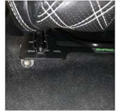
Passenger front right bolt