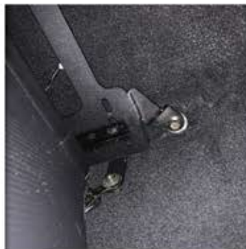
Passenger back left bolt