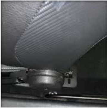
Drivers side back left bolt