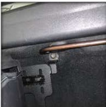
Passenger back right bolt