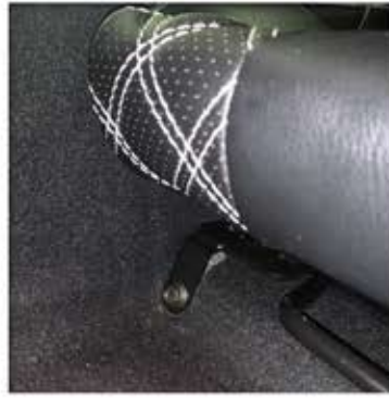
Drivers side front right bolt