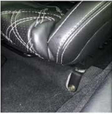
Drivers side front left bolt