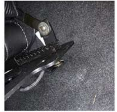
Drivers side back right bolt