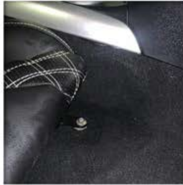
Passenger front left bolt